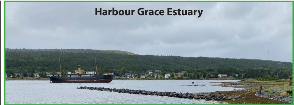
Harbour Grace Estuary