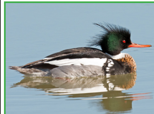
Red Breasted merganser