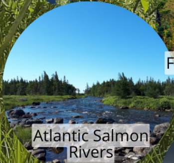
Atlantic Salmon Rivers