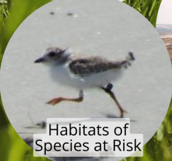
Habitats of Species at Risk

The Stewardship Association of Municipalities (SAM) is an incorporated, non-profit organization. Its members have each formally committed to conserving wildlife habitat in Newfoundland and Labrador. Much of our work is undertaken in partnership with the members of the Eastern Habitat Joint Venture. In particular, SAM works in close partnership with the Province's Department of Fisheries, Forestry and Agriculture, Wildlife Division to identify significant wildlife habitat found within municipal planning boundaries and to encourage municipalities to seek a balance between development and conservation of this land.