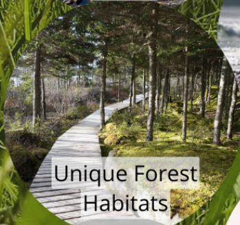
Unique Forest Habitats