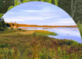
Freshwater Shorelines & Riparian Buffers