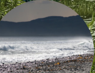
Coastal Estuaries & Beaches