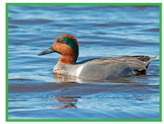
Green-winged teal (Anas carolinensis)