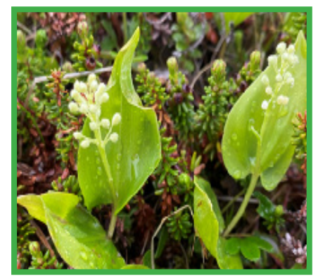
Wild Lilly of the Valley (Maianthemum canadense)