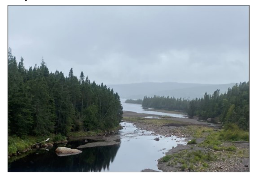
What to look for: